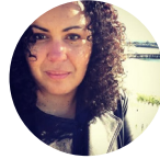
SAFIYA UMOJA NOBLE